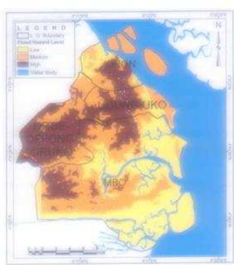
Fig. 3: Flood Hazard Zones of the study area